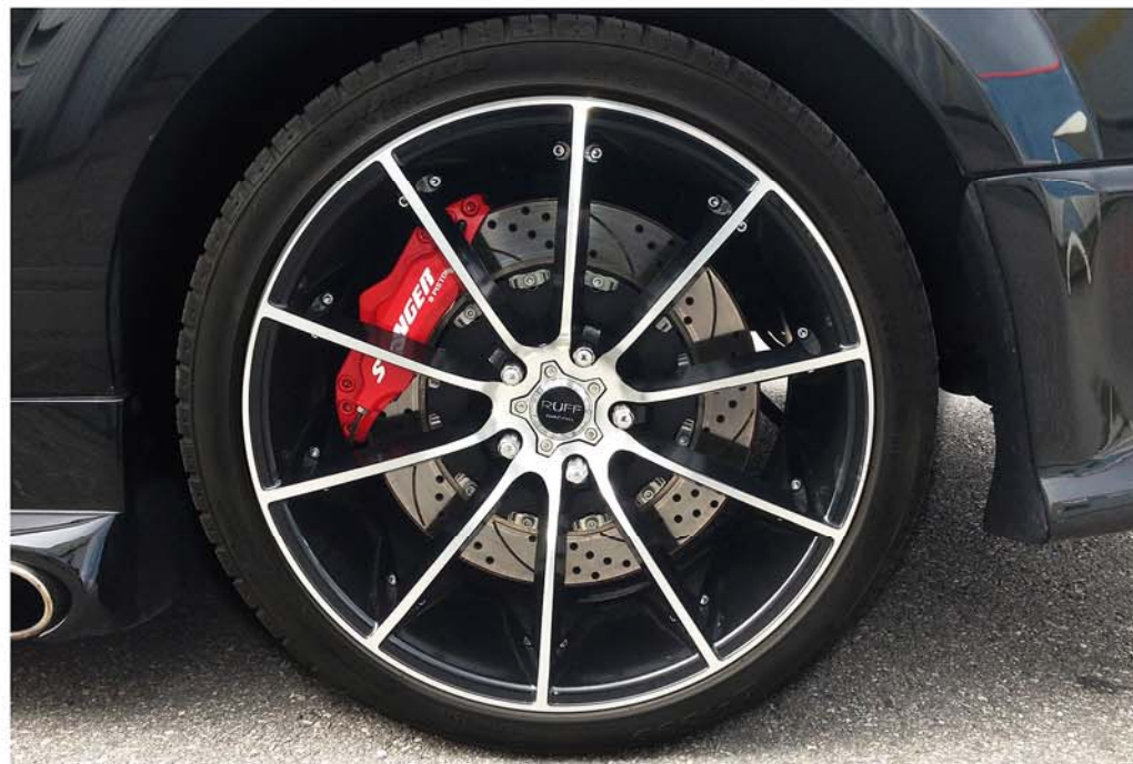
REAR : 380MM - 6-PISTON CALIPER