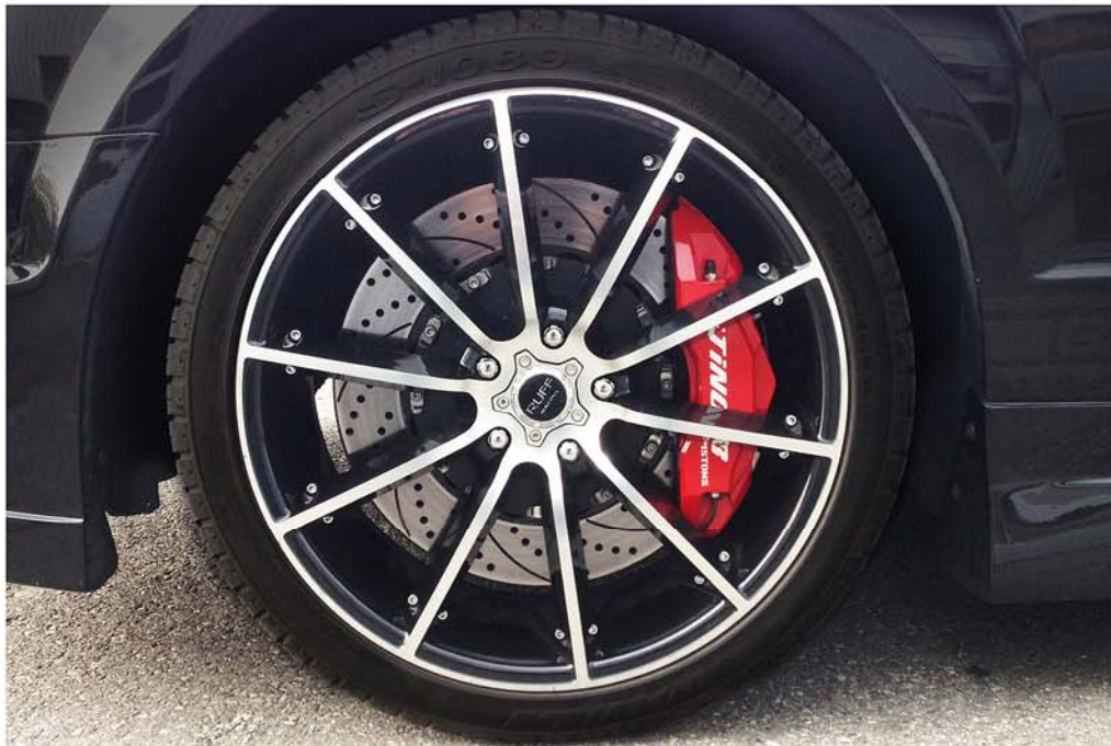
FRONT : 405MM - 8-PISTON CALIPER